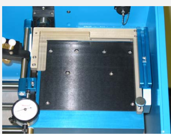
D5L Worktable with Holddown Bar Up

The easily-changed standard fixture has a low shelf for up to \frac{1}{2} " side leads and a through-slot for lead frames. The entire machine is quickly adaptable to special applications including lid-up operations for soldersealed parts and formed lids. All D5L machines accept the D5RT Turntable Module for removing caps from TO headers & round parts.