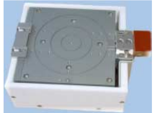
Option X unheated 4x4", mechanical clamping, vacuum