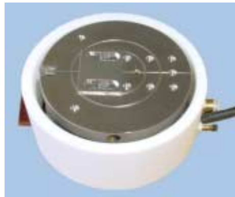
Option TB0000.87.000 heated Ø 80mm, mechanical clamping and vacuum