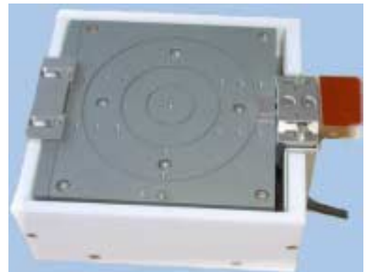
Option 4.4031.0000A heated 4x4", mechanical clamping and vacuum