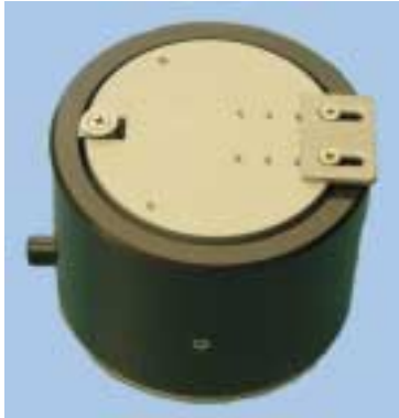
Standard TB0000.93.000 unheated 2x2"