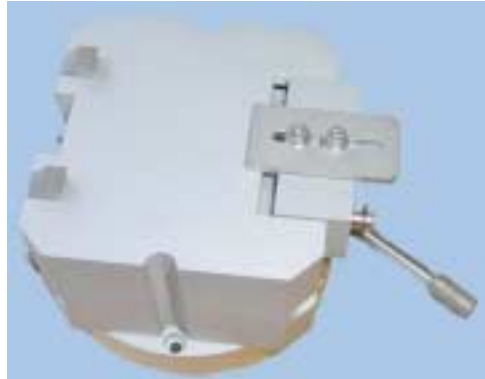
Option TB0000.97.000 unheated 2x2"