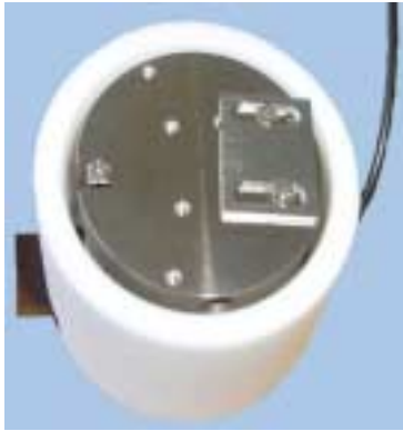
Option TB0000.92.000 heated Ø 60mm, mechanical clamping