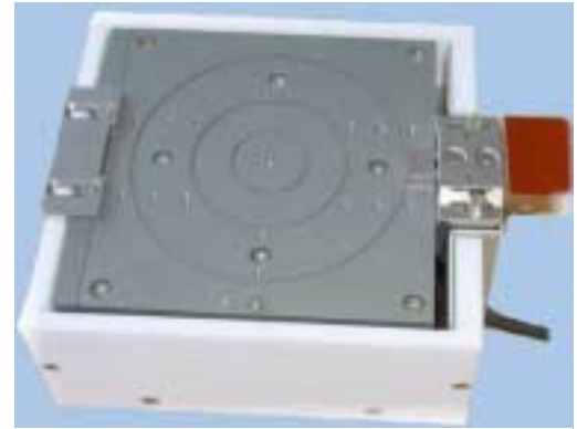
Option 4.4031.0000A heated 4x4", mechanical clamping and vacuum